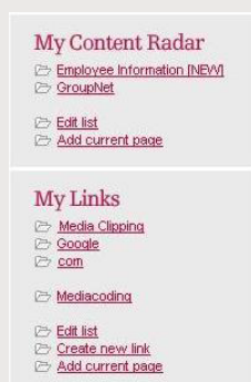
Prepare and distribute personalised content on the intranet